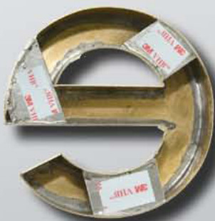
straps + adhesive VHB