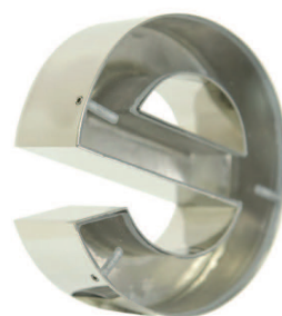
clear polycarbonate backs